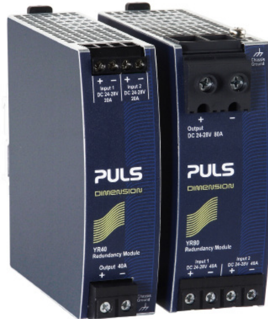
PULS YR40.241 & YR80.241 Redundancy Modules